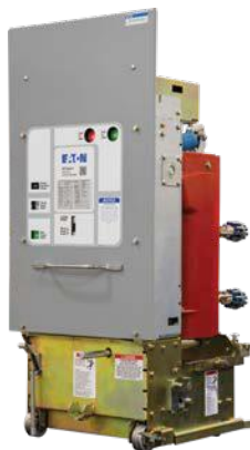
Eaton MV-VR direct replacement circuit breaker