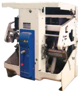
Original circuit breaker

Available for Westinghouse, General Electric, Allis-Chalmers, ITE, Federal Pacific Electric and McGraw Edison. Ground and Test (G&T) devices are also available.