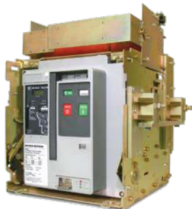
Eaton LV-AR direct replacement circuit breaker