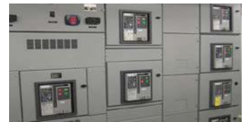
Retrofill before and after